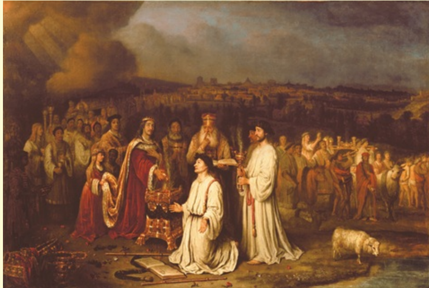
King Solomon Dedicates the Temple Philip de Koninck (c 1664) :: The Feast of the Dedication

www.standrewskentct.org * 860.927.3486 * st.andrew.kent@snet.net